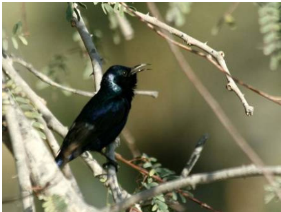
Figure 2. Male Purple Sunbird, Left) in breeding season, Right) pre-breeding plumage, © T. Ghadirian.

In Iran, the male plumage lacks any shiny black appearance in autumn. In November after the mating season, it has a light yellow breast and belly, a dark brown back and a dark line on the chin, throat and belly: this plumage remains through the winter season. After this plumage has moulted completely, in spring the male develops a shiny black appearance, but with violet and green to blue reflections around its head and neck (Fig. 2).