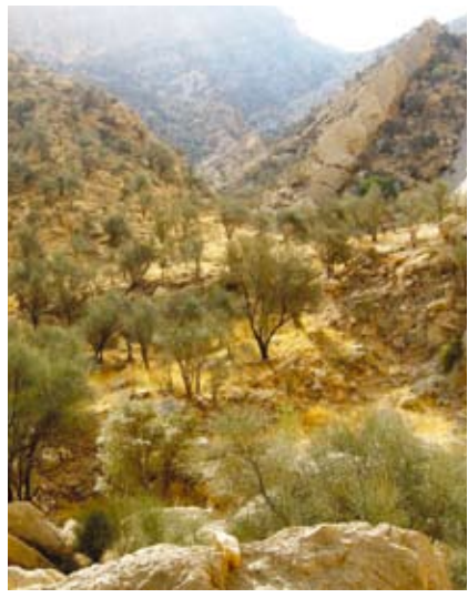
Fig. 2. Ashi Valley, Iran.

The low food availability and the high risk of poaching by local nomads have always threatened this fragile population of leopards in Bushehr Province. These problems could be solved with an appropriate conservation strategy and by upgrading Khaeez to a protected area with sufficient facilities. To understand the presence of this elusive species in this part of the country in the context